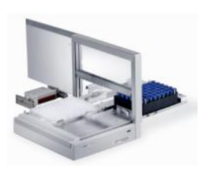
Fig 2: Automation Interface Agilent Technologies