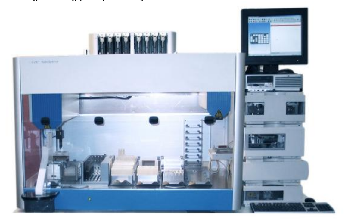
Fig 1: CyBi®-RoboSpense platform for flexible liquid handling with an integrated Agilent 1100/1200 HPLC system

The following application note describes automation of the tryptic mapping process on the CyBi®-RoboSpense liquid handling platform. Integrating an Agilent 1100/1200 HPLC system completes the automation. Thus, any manual interactions from reading sample tube barcodes to generating peak profiles by HPLC are eliminated.