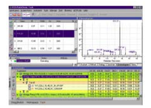
Figure 4: Data is summarized in a project management interface. Retention times for each method, sample, replicate injection, and detector are summarized in a table. The original data files are hyperlinked, so that data can be reviewed and reprocessed if necessary.

raw data files are maintained, so that data may be conveniently accessed for review and reprocessing, if necessary. The details are described elsewhere.<sup>7</sup>