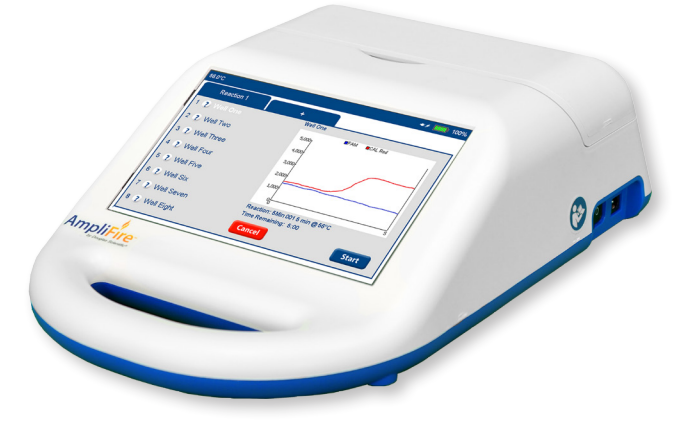
Figure 1. AmpliFire Point of Use Instrument

fluorescence detection. Data then can be displayed and analyzed on the touch screen interface as the reaction progresses, or exported for further analysis.