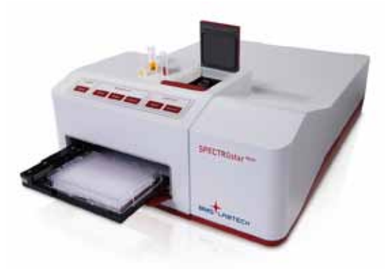
Fig. 2: BMG LABTECH's SPECTROstar Nano absorbance reader

Herring Sperm dsDNA and HPLC grade water was obtained through normal distribution channels.