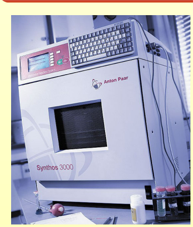
Anton Paar Synthos 3000