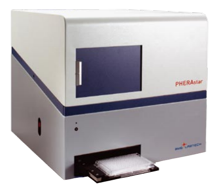
Fig. 1: BMG LABTECH's multimode plate reader PHERAstar