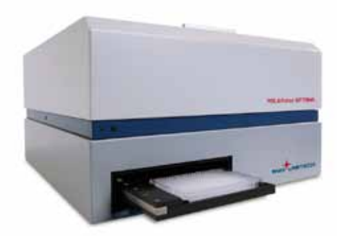
Fig. 2: BMG LABTECH's POLARstar OPTIMA multidetection microplate reader.