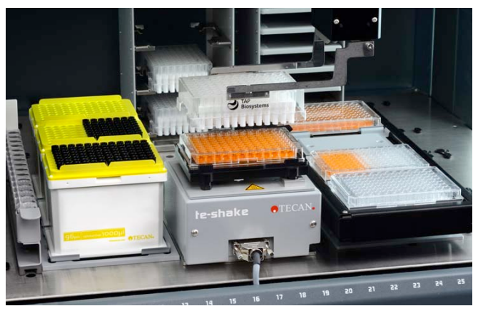
Figure 2 Freedom EVO equipped with carriers for automation of RAFT 3D cell culture. The RoMa Arm is holding a RAFT absorber plate, and a gelfilled cell culture plate is positioned on the Te-Shake. A cooled carrier containing cell culture plates is mounted to the right of the Te-Shake.

The RAFT process was automated on a Freedom EVO liquid handling workstation equipped with an eight-channel Liquid Handling (LiHa) Arm using disposable tips, a Robotic Manipulator (RoMa) Arm, a Te-Shake<sup>®</sup> (heater-shaker), and cooled carriers (4 °C; active cooling of the reagents and the collagen solution is essential to control gel formation) for storage of reagents and microplates (Figure 2).