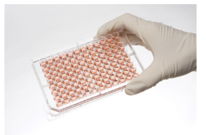
Figure 2 ThermoScientific Nunc Edge plate with solid reservoir.