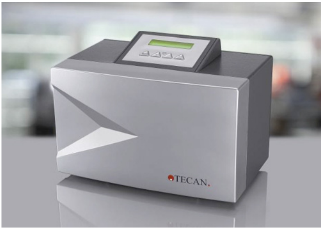
Figure 1 Tecan's patent pending Gas Control Module (GCM), compatible with the Infinite 200 PRO series.

When using Tecan's GCM in combination with the Nunc<sup>™</sup> Edge<sup>™</sup> plate, cellular survival and proliferation are no longer limited to common CO<sub>2</sub> incubators. This allows long-term cellbased analysis, such as cell proliferation studies, to be performed inside the reader, offering reproducible measurements without gaps in the data.